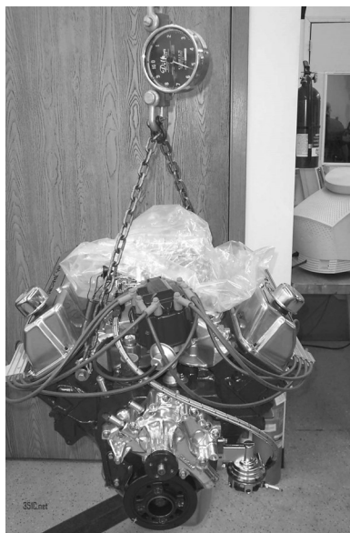
400 Ford Iron heads iron alloy intake 550#