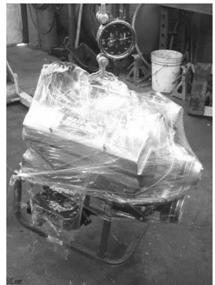
SBC Iron Dart heads and Alloy intake 460# (engine stand and chain 12#) so, 448#