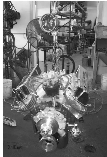
347 351C Ford (stroker) CHI alloy heads alloy intake, alloy water- pump alloy pulleys 410 #