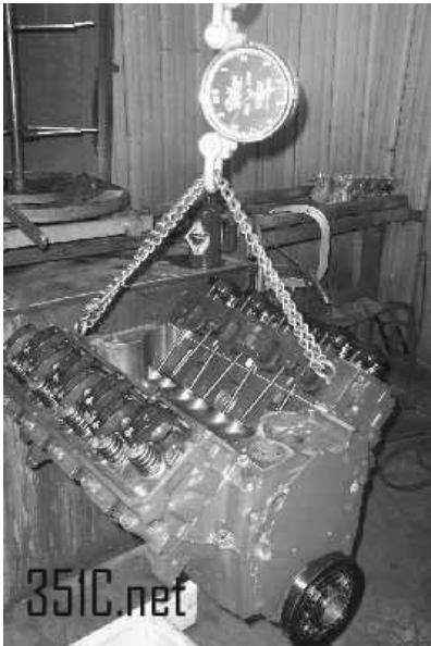
400 Ford short block iron heads no intake, wp, dizzy, ect. 440 #