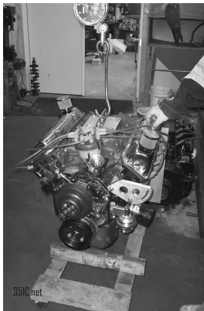
351C Ford 4V heads iron intake, iron water pump, flexplate and trans drive, fuel pump alt. bracket, mini-starter and mid plate 535#